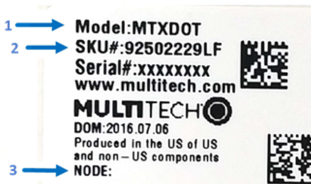
Example xDot Device Label