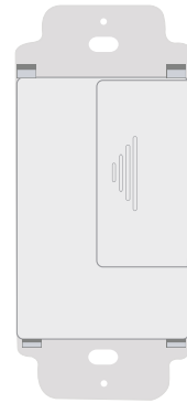
DD1530 Back side