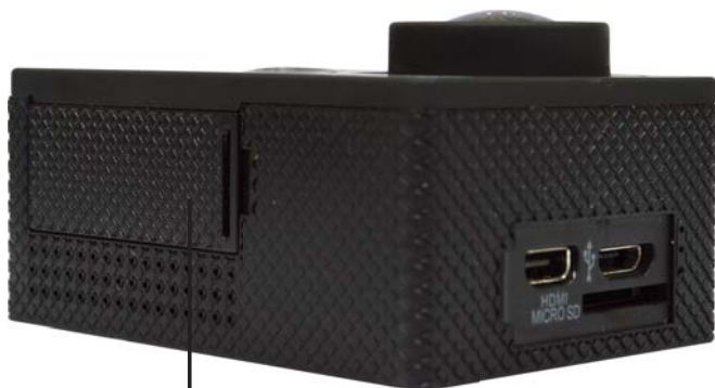
Door of the battery