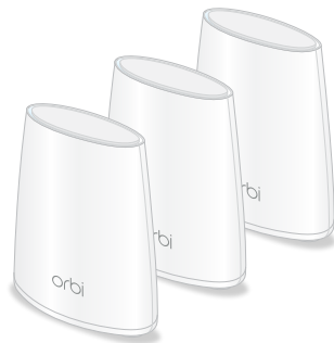
Orbi Satellite (3) (Model RBS20)