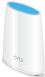
Orbi Router (Model RBR40)