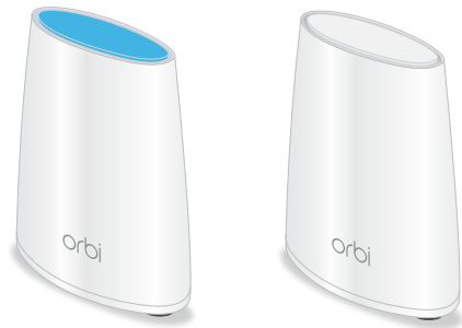
Orbi Mini Router (Model RBR40)