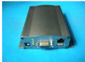
Figure 1 NFC-4311

NFC-4311 support NFC company protocol. To meet the requirement about protocol and function expanding, and protect user's investment, the reader can be upgraded with our upgrade software conveniently.