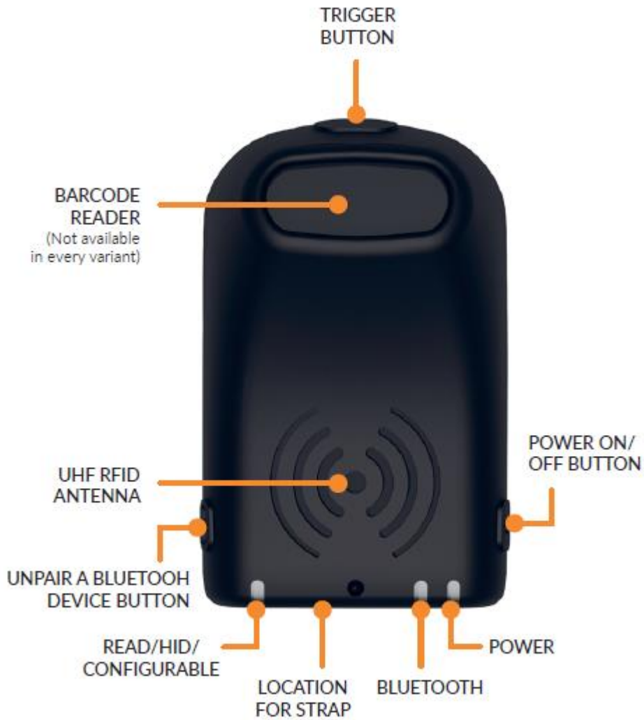
Picture 1. Key features of Nordic ID EXA31