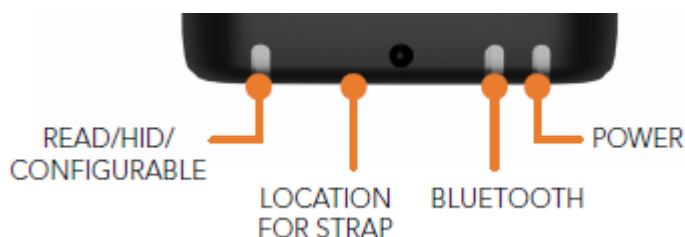
Picture 3 Location of LEDs

Nordic ID EXA31 has three LEDs for user indications. Location of the LEDs (Read/HID/Configurable, Bluetooth and Power) can be seen in Picture 3.