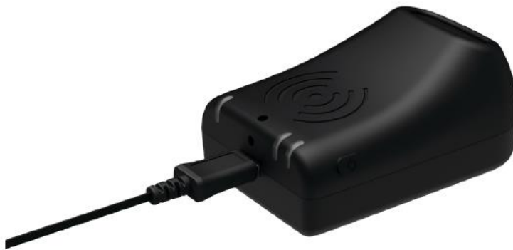
Picture 1 Charging Nordic ID EXA31 via USB charger

Charging status is indicated by Power LED. Please see section 1.11.2.3 for information how the Power LED functions in different situations.