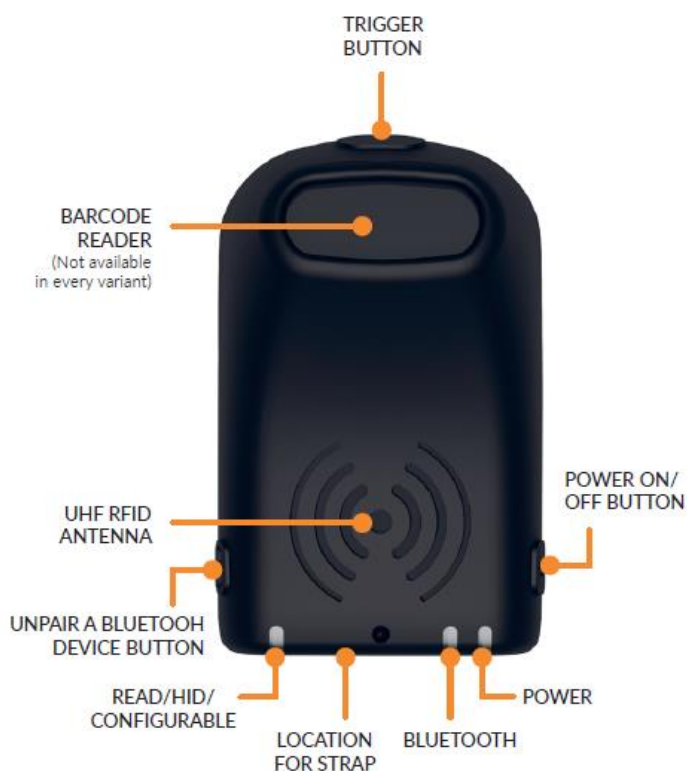
Picture 2 Location of the buttons

Nordic ID EXA31 has three physical buttons for user interactions. Location of the buttons can be seen in Picture 2.