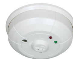
Carbon Monoxide Sensor DXS-80