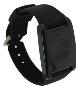
Wristband Sensor DXS-LRC