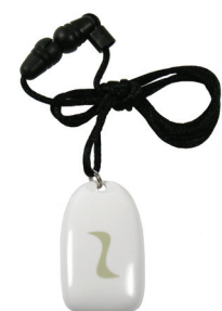
Pendant Sensor DXS-LRP