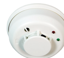
Smoke Sensor DXS-73