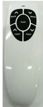
Remote model (RF2205)