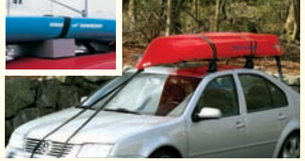
Cockpit-side down on rack, inset using pads only

Your new boat is carefully crafted to ensure optimum durability. But improper storage can quickly degrade hull