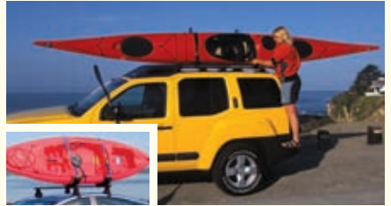
On the side using Stackers, inset using J-style