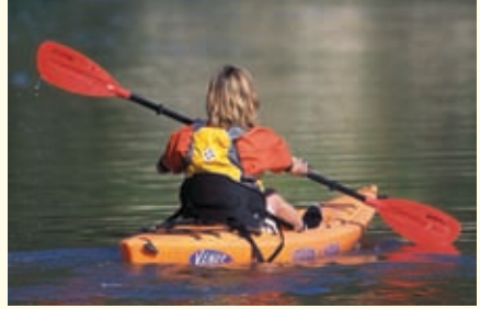
Place the blade in the water near your toes

Before you set out, it is important to get good instruction. Check with your dealer or local club to find out about classes offered locally. You should look for a course that covers basic strokes, braces and rescue techniques. With any outdoor activity, it is also good to be familiar with first aid, especially CPR and treatment of hypothermia.