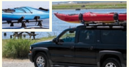
Right-side up using a Hullavator, inset using saddles

shape, color and UV-protection. Storage is key!