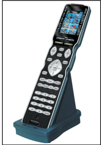
The MX-980 on it's Charger.

The Status light should immediately light. Red indicates that it is charging. Blue shows that it is fully charged. There is no harm in leaving the MX-980 on its charging base whenever it is not in use. The Lithium Ion battery cannot be overcharged.