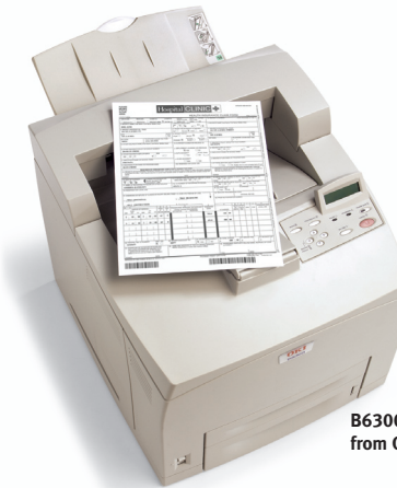
B6300n Digital Mono printer from OKI Printing Solutions

The solution enables schools to migrate from hard copy pre-printed forms into an electronic format for more efficient processing and distribution.