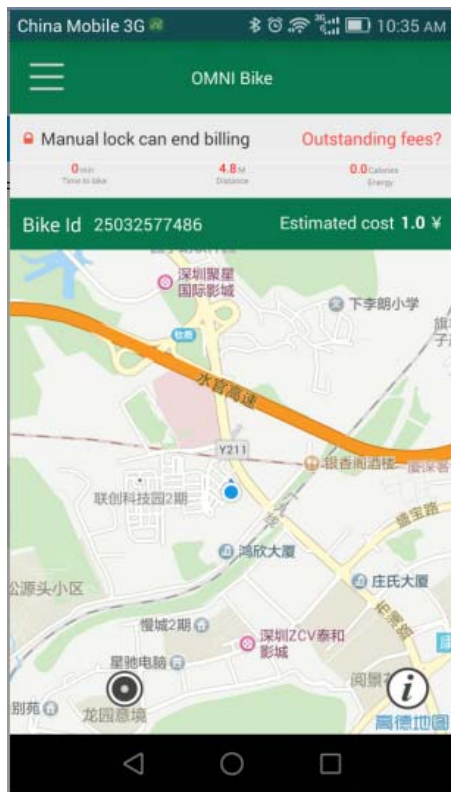
unlocking and using bike page