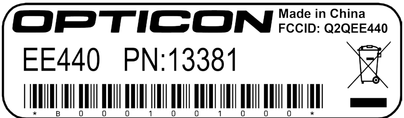
Figure 2: product label