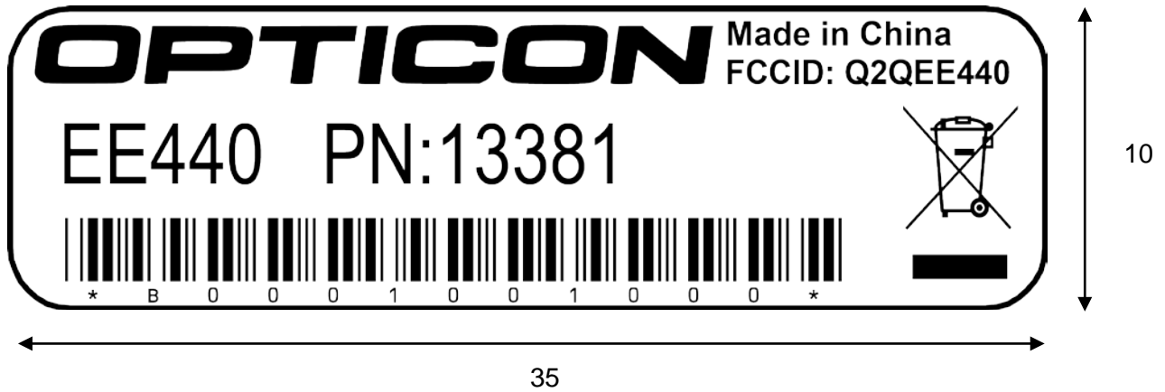
Figure 3: product label dimensions

The dimensions of the product label are as follows: