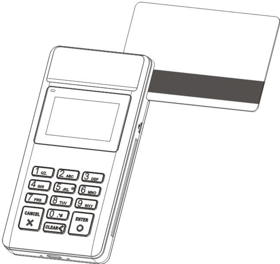
Figure 3. Swipe magnetic stripe card

When swiping, the backside of the card must be faced up as shown in Figure 3. Bi-directional swiping is supported. Please swipe the card with a constant speed.