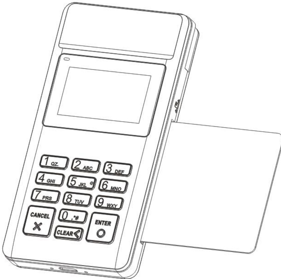
Figure 4. Insert smart card

When inserting smart card into its slot, the chip of smart card must be faced up. In order to avoid any physical damage to the card or the smart card slot of the terminal, it is recommended to insert the card gently. If smart card is successfully detected by the terminal, the icon of the smart card will be shown on the top of screen.