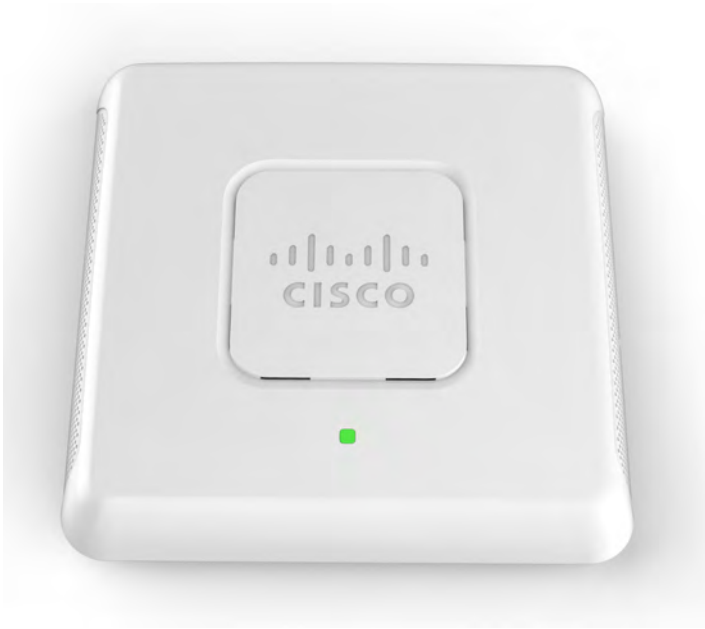
Cisco WAP571 Wireless-AC/N Premium Dual Radio Access Point with PoE