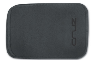
Soft protective case