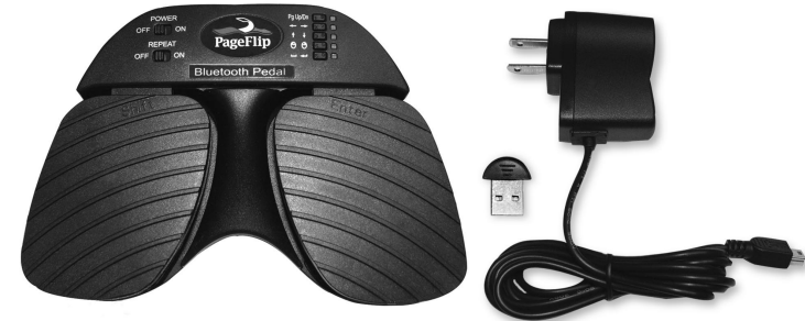
Figure 1: Package contents: PageFlip Cicada, Bluetooth USB micro adapter, and universal AC adapter.