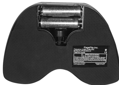
Figure 2: Battery cover is located at the bottom of the PageFlip Cicada. A convenient storage compartment for the Bluetooth dongle lies alongside the batteries.

Note: To conserve battery power, turn off device when not in use. The unit automatically turns off after two hours of inactivity, but can awake instantly upon a pedal tap.