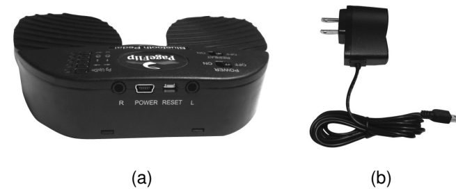
Figure 3: (a) Rear view of PageFlip Cicada; (b) insert universal AC adapter into rear POWER outlet using the 6' mini-USB cable.

In addition to being battery-operated, PageFlip Cicada may also be plugged into the wall via the universal AC adapter (Fig. 3). For added versatility, the pedal may be powered by connecting it directly to the USB port of a computer.