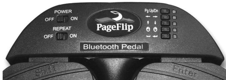
Figure 4: Top view of PageFlip Cicada control panel.