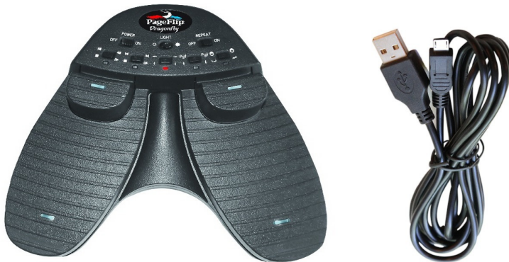
Figure 1: Package contents: PageFlip Dragonfly and USB cable.