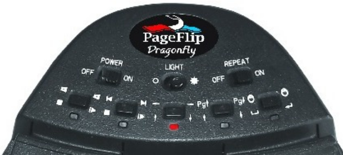
Figure 3: Top view of PageFlip Dragonfly control panel.