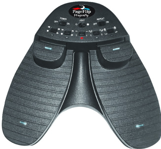
Figure 6: Primary (larger) and secondary (smaller) pedals. Each of these four pedals has an LED light that can be turned on for use in dim venues.