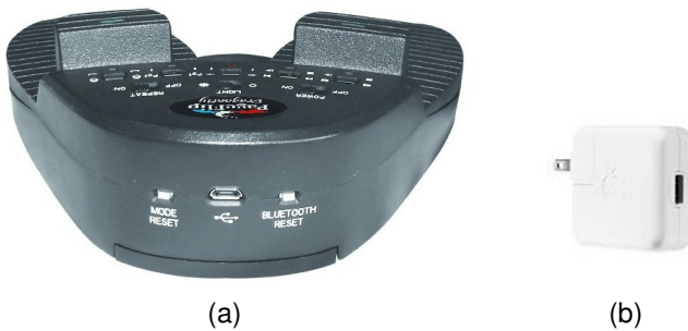
Figure 2: (a) Rear view of PageFlip Dragonfly. Attach the micro-USB end of the 6' USB cable (Fig. 1) into the rear micro-USB outlet and connect the other end into a computer USB port or (b) any USB AC adapter, such as those found on iPads and iPhones.

In addition to being battery-operated, PageFlip Dragonfly may also be powered via the supplied USB cable (Fig. 1). Simply plug one end of the USB cable into the micro-USB outlet on the rear of the PageFlip Dragonfly (Fig. 2) and plug the other end into a USB AC adapter or a computer's USB port.