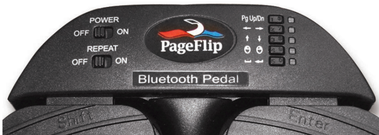
Figure 4: Top view of PageFlip Firefly control panel.