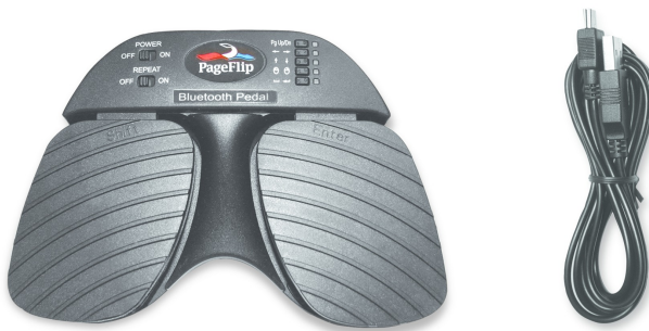
Figure 1: Package contents: PageFlip Firefly and USB cable.