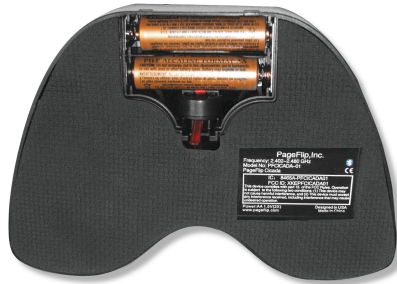
Figure 2: Battery cover is located at the bottom of the PageFlip Firefly.

Note: To conserve battery power, turn off device when not in use. The unit automatically turns off after 30 minutes of inactivity, but can awake instantly upon a pedal tap.