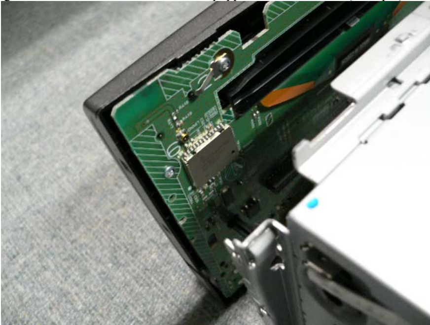
Fig 4. Enlarged view of “YEP0PT9918A0” be equipped for a Car Audio (example)