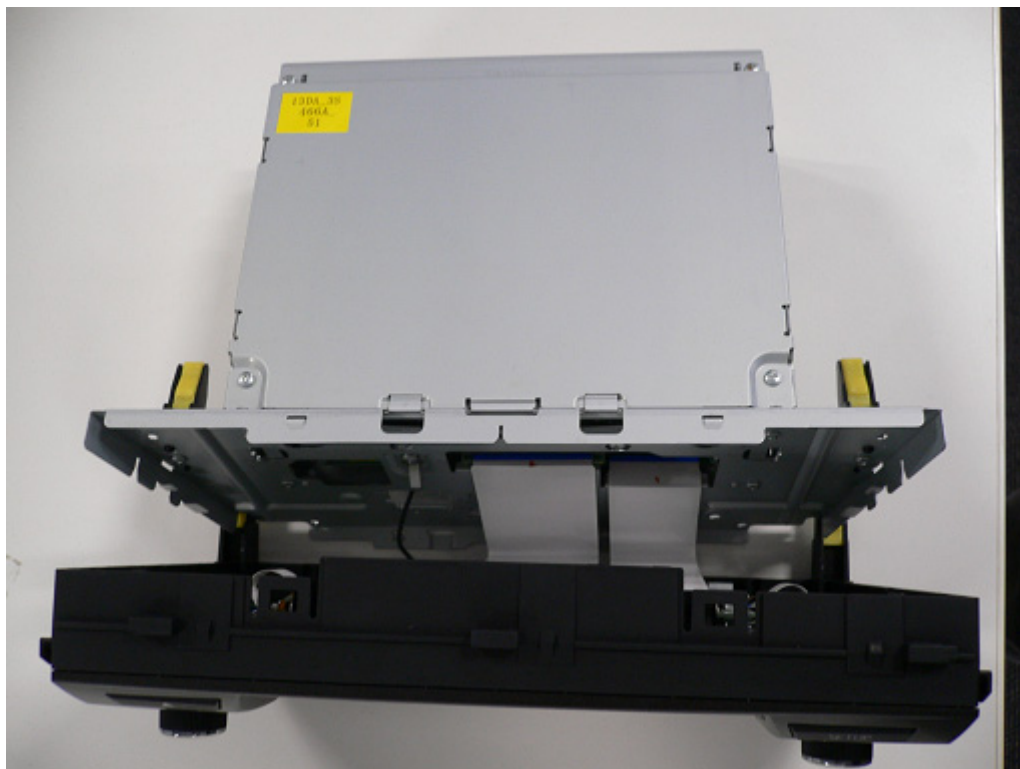
Fig 4. Front view of “YEAP01A446”, “YEAP01A473” be equipped for a Car Audio (example)