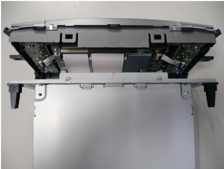
Fig 3. Top view of “YEAP01A727”, “YEAP01B897” be equipped for a Car Audio (example)