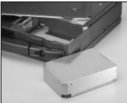
Easily removable HDD mounted in shock-absorbing gel, encased in stainless steel.