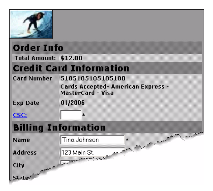
FIGURE B.1 Order form with values