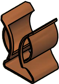
ISOMETRIC SCALE 1 : 1