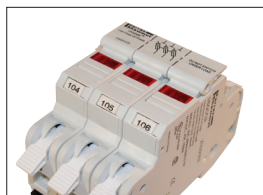
WMB Marker System