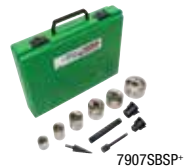
7907SBSP SPEED PUNCH Kit ½" TO 2" CONDUIT