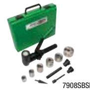
7908SBSP SPEED PUNCH Kit with Quick Draw 90 ½" TO 2" CONDUIT