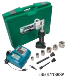
LS50L11SBSP SPEED PUNCH Kit with Battery-Powered Driver ½" TO 2" CONDUIT