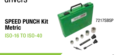
7217SBSP SPEED PUNCH Kit Metric ISO-16 TO ISO-40