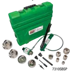
7310SBSP SPEED PUNCH Kit with Hydraulic Pump and Ram ½" TO 4" CONDUIT