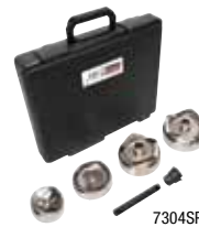
7304SP SPEED PUNCH Kit Large Diameter 2½" TO 4" CONDUIT