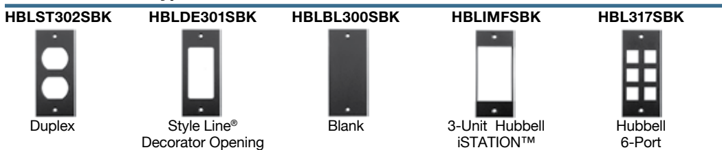
Table Top Boxes