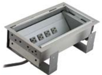
WSBG43UBAL (Cover doors shown open)