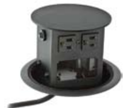
WSBH42U with WSBHTRBK