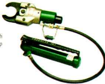
750H767 model with 767 Hand Pump