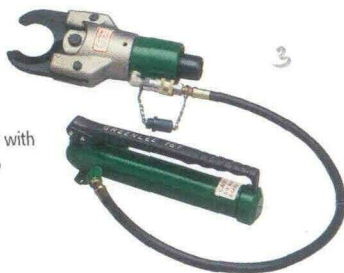
750H767 model with 767 Hand Pump