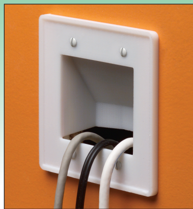
CE2 with SCOOP facing IN