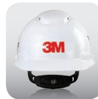
3M™ Head and Face Protection