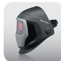
3M™ Welding Protection