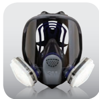
3M™ Reusable Respirators