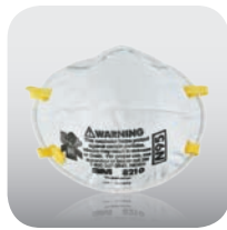
3M™ Disposable Respirators