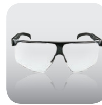
3M™ Protective Eyewear