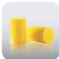
3M™ Passive Hearing Protection