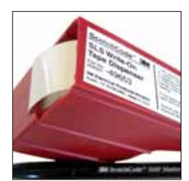
3M<sup>™</sup> ScotchCode<sup>™</sup> Write-On Dispensers