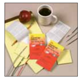
3M^{\scriptscriptstyle{\top\!\!\!M}} ScotchCode ^{\scriptscriptstyle{\top\!\!\!M}} Wire Marker Books