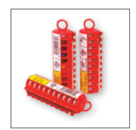
3M™ ScotchCode™ Tape Dispensers