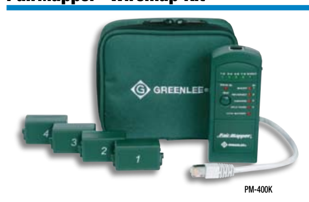
Use to identify various wiring faults found in 10 BASE-T and other four-pair, twisted pair cables per TIA/EIA 568A and 568B.