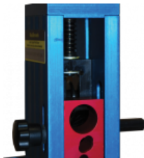
COPPER WIRE STRIPPER JR.