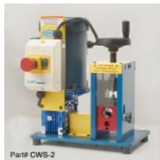
COPPER WIRE STRIPPER - CWS-2