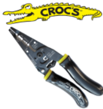
CROC'S - NEEDLE NOSE WIRE STRIPPERS