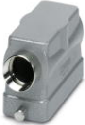
HEAVYCON B16 sleeve housing, for single locking latch, height: 65 mm, with 1 x M25 gland, lateral cable outlet

Please be informed that the data shown in this PDF Document is generated from our Online Catalog. Please find the complete data in the user's documentation. Our General Terms of Use for Downloads are valid ( http://phoenixcontact.com/download )