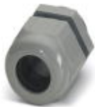
Cable gland, Cable gland material: Polyamide, External cable diameter 11 mm ... 17 mm, Shielding: No, Connecting thread: M25, Color: silver-gray RAL 7001

Cable gland - G-INS-M25-M68N-PNES-GY - 1411126