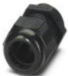
Cable gland, Cable gland material: Polyamide, External cable diameter 11 mm ... 17 mm, Shielding: No, Connecting thread: M25, Color: jet black RAL 9005

Cable gland - G-INS-M25-M68N-PNES-BK - 1411134