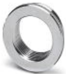
Step-down adapter, M25 to M20, including O-ring

Reducing adapter - REDUC-M-KV-M25/M20 - 1647624