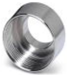
Step-up adapter, M25 to M32, including O-ring

Extension adapter - ENLAR-M-KV-M25/M32 - 1647679