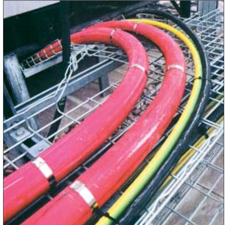
Electrical Power Cable Support