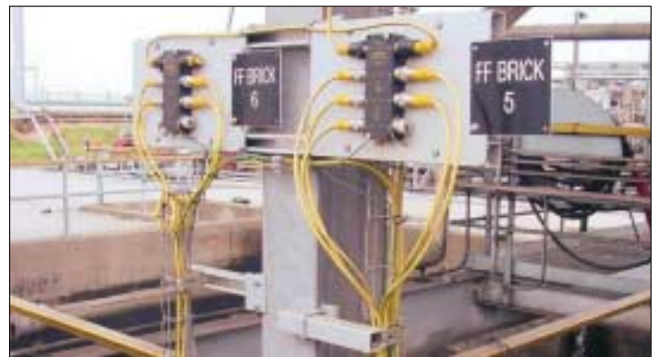
Instrumentation for Industry