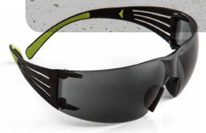
3M<sup>™</sup> SecureFit<sup>™</sup> Protective Eyewear, 400 Series

The original 3M^{\text{\tiny TM}} SecureFit<sup>TM</sup> Protective Eyewear, 200 Series featured the proprietary self-adjusting 3M^{\text{\tiny TM}} Pressure Diffusion Temple Technology — a scientific advancement that helps diffuse pressure over the ear, enhancing frame temple comfort while not compromising the security of fit. But the innovation doesn't stop there — Introducing 3M^{\text{\tiny TM}} SecureFit<sup>TM</sup> Protective Eyewear, 400 Series.