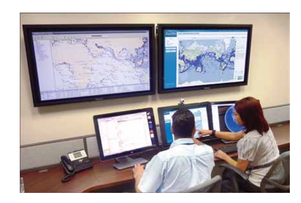
24 x 7 Operations Center