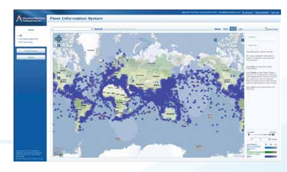
Tracking the world's largest fleet