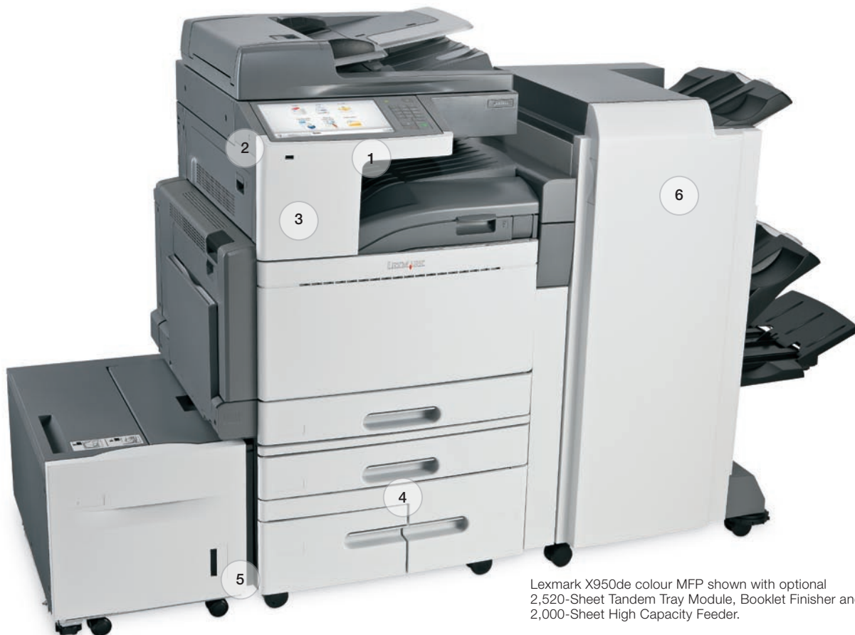
Lexmark X950de colour MFP shown with optional 2,520-Sheet Tandem Tray Module, Booklet Finisher and 2,000-Sheet High Capacity Feeder.