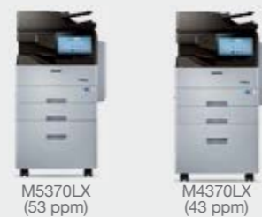
M5370LX (53 ppm)