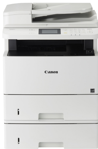
Main unit + 1 Paper Feeder Unit PF-45