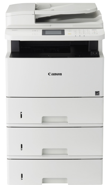
Main unit + 2 Paper Feeder Units PF-45