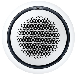
700555 Samsung 360 cassette Round Grill - White