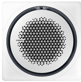
700553 Samsung 360 cassette Square Grill - White