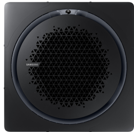
700557 Samsung 360 cassette Square Grill - Black