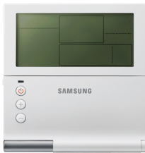
700551 Samsung Premium Wired Thermostat for 700845 only