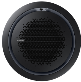
700559 Samsung 360 cassette Round Grill - Black