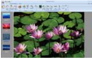
The Image Editing Helper main screen

Image Editing Helper software package allows a user to manipulate digital images with ease. With Image Editing Helper, you can rotate, flip, crop, deskew, invert, soften, sharpen, stitch, and even OCR photos or pictures.