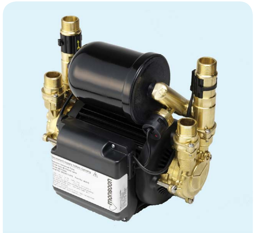
Monsoon Universal Twin Pumps