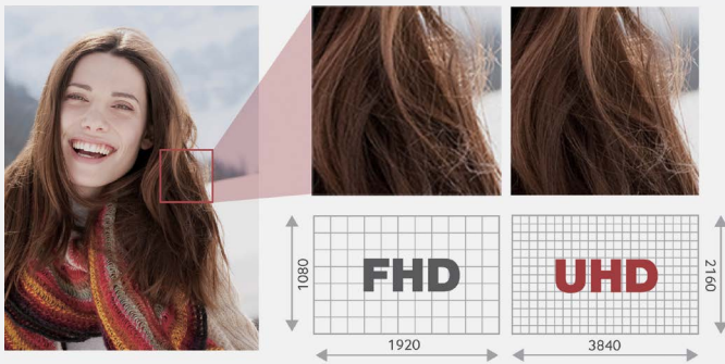
Figure 2. UHD high pixel density provides accurate detail representation.

QMD Series delivers four times the FHD resolution on the same screen area, resulting in the most accurate recreation of details possible. Text that displays on QMD Series in UHD is super-crisp due to its high pixel density. High-detail visuals, such as photos and videos, are visible with the smallest details for a hyper-realistic and immersive visual experience.