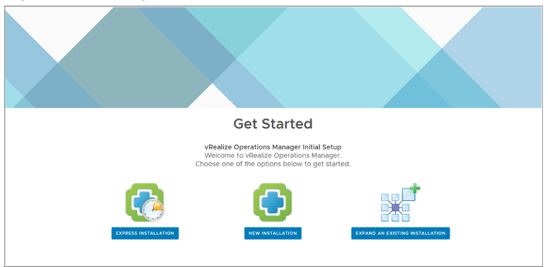
Figure 3-1. Getting Started Setup