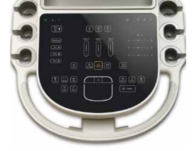
Simplicity Mode – OFF