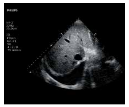
RUQ - fluid noted posterior to the liver