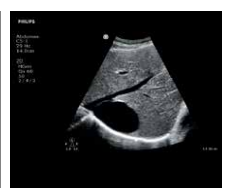
RUQ of the abdomen