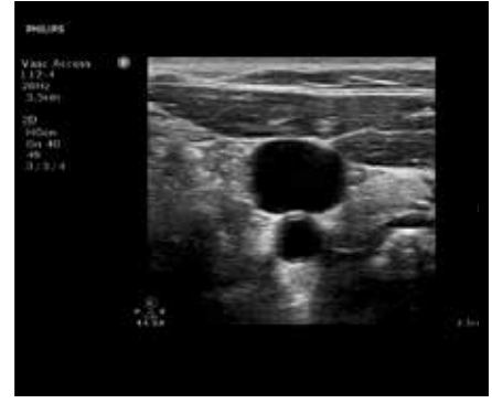
IJ and carotid