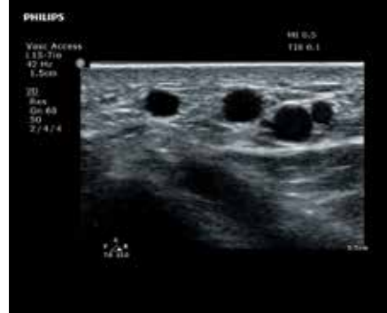
Vessels in the wrist