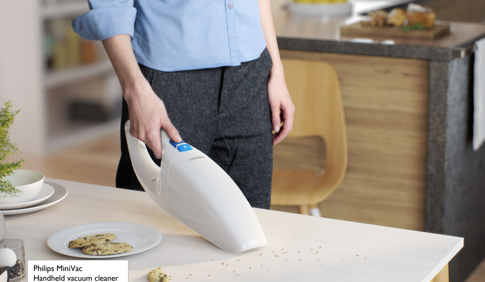
Philips MiniVac Handheld vacuum cleaner