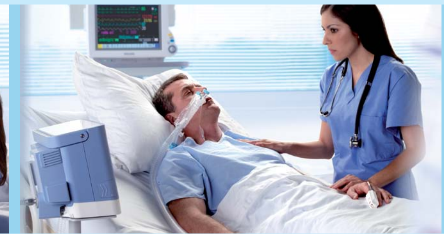
Passive circuit allows a simpler setup