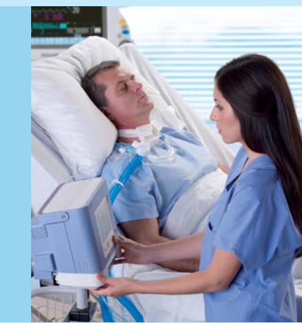
Intuitive menu for quick changes