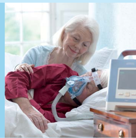
Trilogy 100 ventilator for home-bound patients